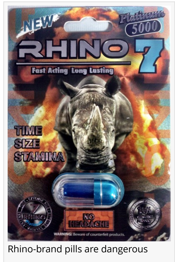
Rhino-brand pills are dangerous