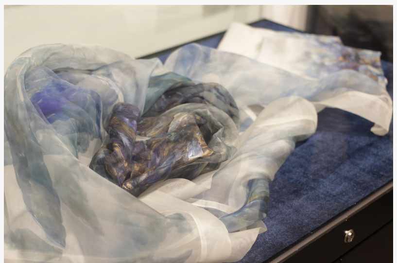
A unique art bedding design inspired by the boundlessness of sleep

Although a luxury goose down bedding brand, Crown Goose differentiates itself from other bedding brands through unique collaborations with artists and other luxury brands. Project