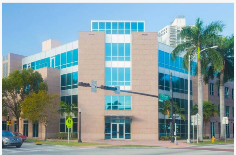
Office of PDG Physician Defense Group, Miami Beach FL 2

Physician Defense Group, LLC (PDG) is a Miami-based Online Reputation Management (ORM) company focusing on physicians who have adverse information such a disciplinary action circulating on the internet. While one cannot simply delete most such adverse information, it can become much less relevant once the positive aspects of a doctor’s practice are appropriately displayed. To this end, PDG has developed a proprietary system for Online Reputation Management. PDG was founded by Internet Marketing Specialists and Law Practice Managers who have first-hand experience with the challenges of the practice of medicine, and the negative effects of the internet on reputation and business development. PDG’s website is