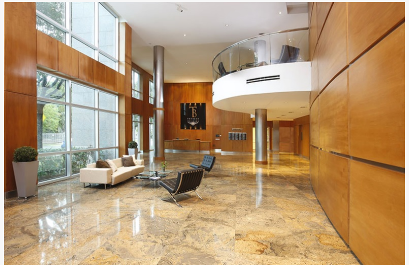
Office of Physician Defense Group, Miami Beach FL 1