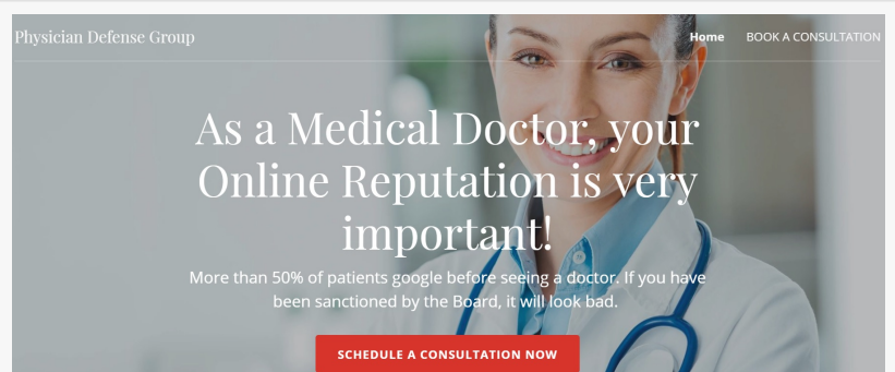
Website Physician Defense Group, Miami Beach FL

PDG focuses in particular on physicians who are adversely affected by the disciplinary system of