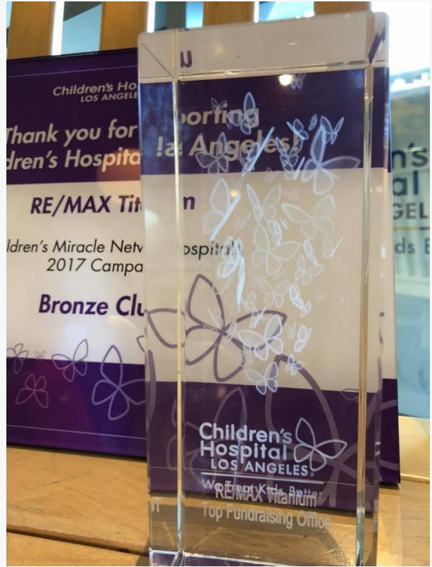
Rudy L Kusuma Home Selling Team #1 Top Fundraising Children Hospital Los Angeles