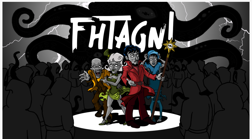
Fhtagn! - Tales of the Creeping Madness

In its first instalment, this party/boardgame-esque game saw the cult of The Dreaming Eye trying to wake the thing of the idols, that green, sticky spawn of the stars (can you guess who?) to claim the world. Now, there is a new cult in town – The Thousand Young. These sycophantic backstabbers are devoted to the All-Mother and Mother only wants the best and the brightest. You have 6 rounds to build up the required stats needed to use the ritual items in the final ritual, but you also need to outwit your "friends" and make sure it is them on the chopping block and not you. For every successful round you complete, you get 'Not It' stacks, which you use in the end of the game to determine who will be sacrificed to dear Mother. The player who receives the