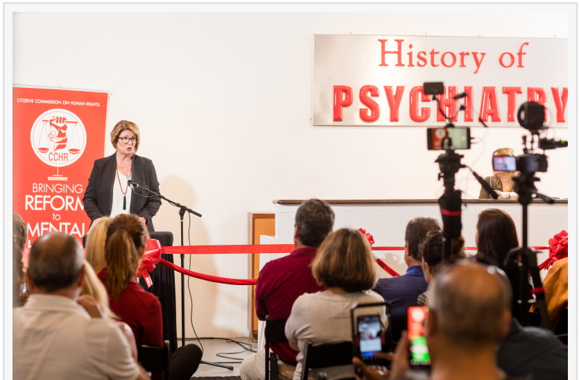
Hosted by the Florida chapter of CCHR, the exhibit attracted educators, psychologists and other mental health practitioners who are concerned with the surge in psychiatric labeling and drugging of children.

The Florida chapter of CCHR also has a permanent installation of this exhibit located in their center in downtown Clearwater. Unveiled in July of 2015, the Florida version of the Psychiatry: An Industry of Death museum, presents the unvarnished history of psychiatry while also providing information on the state of psychiatry today. Consisting of 14 audiovisual displays revealing the