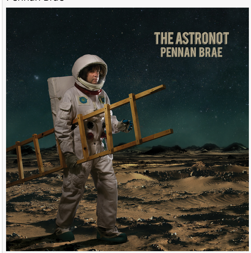
The Astronot Album Cover