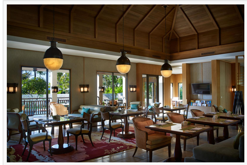
A cozy Club Lounge at The Ritz-Carlton, Bali

glamorous beachfront wedding chapel, makes an idyllic setting for destination weddings, while a range of outdoor event venue and extravagant spaces provide the perfect scene for celebratory events and wedding reception in Bali. Well-appointed conference venues, luxurious meeting spaces, customizable residential packages and experienced organizers also entice those looking to create inspired MICE Tourism events in Bali. Whether work, pleasure or romance is on the agenda, The Ritz-Carlton, Bali is the place to make memories that last a