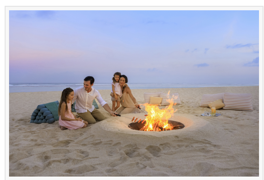
Family Bonfire by the beach

"Condé Nast Traveler is one of the leaders in the world travel industry, motivating a discerning readership with incomparable travel experiences and exotic destinations. We are honored to be acknowledged in these awards and thrilled that our dedication to creating highly memorable