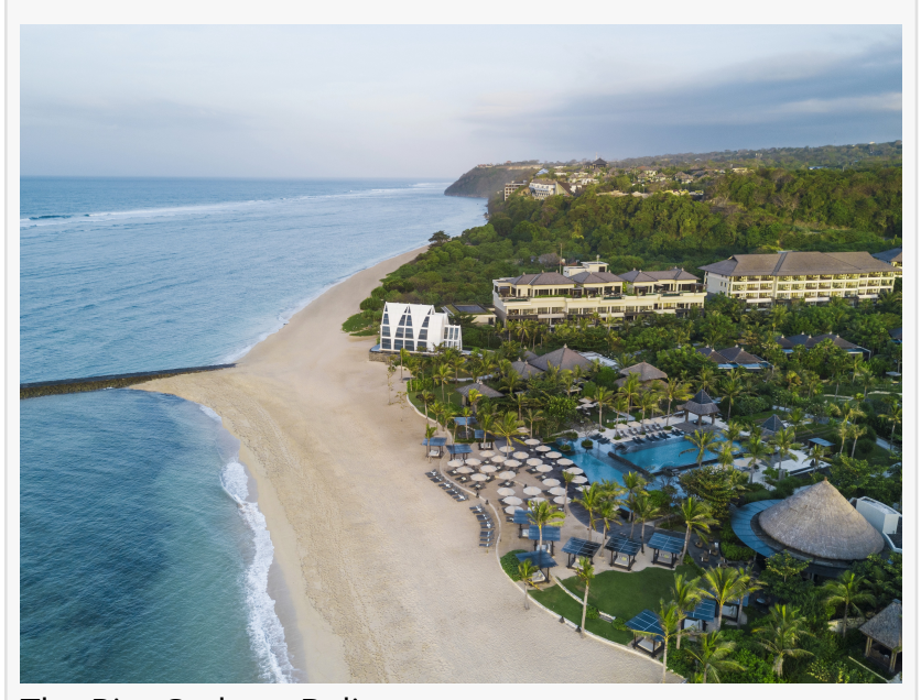
The Ritz-Carlton, Bali