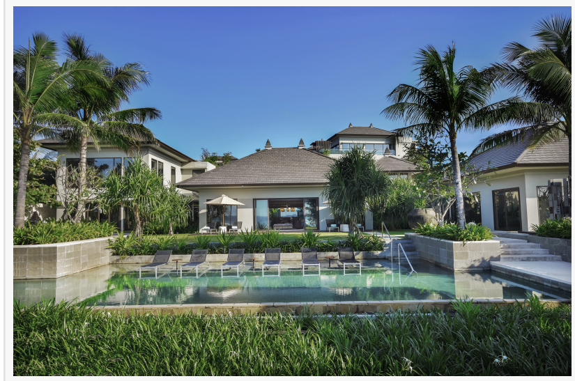
beach front villa

About The Ritz-Carlton, Bali. Located on a stunning beachfront combining with a dramatic clifftop setting, The Ritz-Carlton, Bali is a luxurious resort offering an elegant tropical ambience. Featuring tranquil views over the azure waters of the Indian Ocean the resort has 279 spacious suites and 34 expansive villas, providing the sheerest of contemporary Balinese luxury. Along the foreshore are The Ritz-Carlton Club<sup>®</sup>, six stylish dining venues, an indulgent and exotic marine-inspired Spa, and fun, recreational activities for children of all ages at Ritz Kids. A