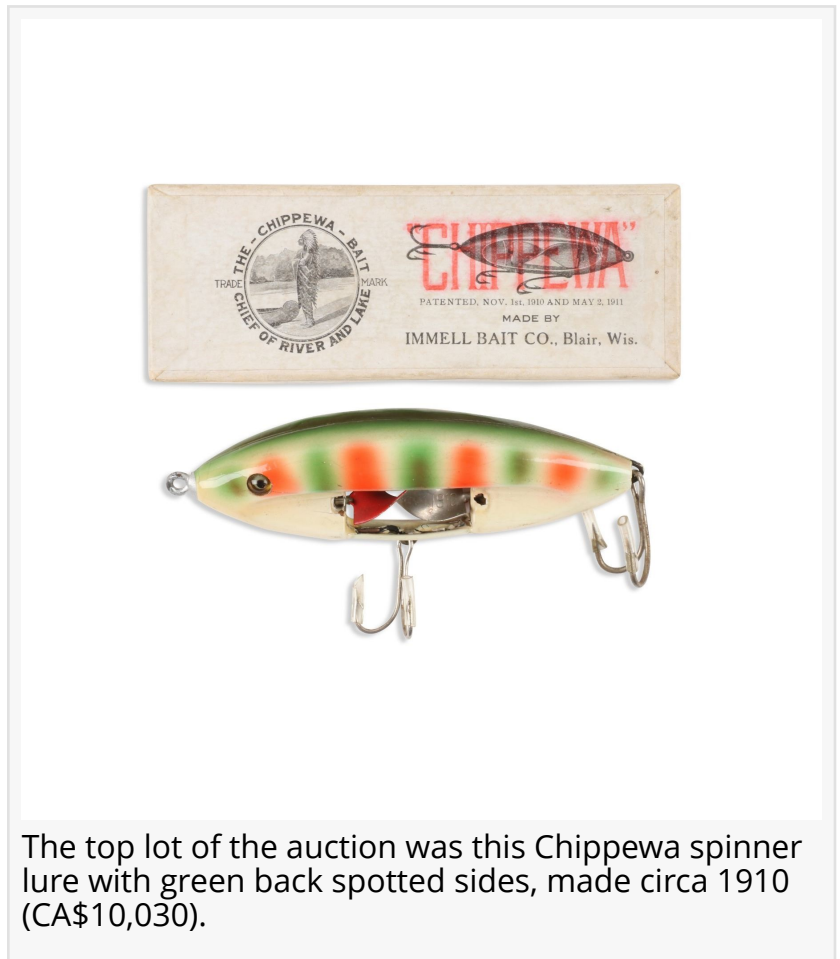
The top lot of the auction was this Chippewa spinner lure with green back spotted sides, made circa 1910 (CA$10,030).

The runner-up lots were a Chippewa in fancy green back, in the box, made of wood and in very good-plus condition (CA$7,670); and a Chippewa in green with back spotted sides, in the box, made of wood and graded very good (CA$7,080). Three rainbow Chippewas also cracked the top