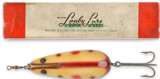
Lauby Lure (USA) Lake Trout wonder spoon, made of wood in the 1930s (CA$2,006).