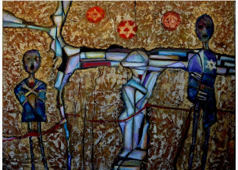
Yanay Prague; Wailing wall prayers of Holocaust 120 cm x 90 cm, 47 inches x 35 inches, acrylic, sand on canvas

Yanay Prague: There are many places I would still like to visit. I appreciate the United States, particularly parts of Florida. I also like to spend time in the Bahamas; Sydney, Australia; and Johannesburg, South Africa. I used to live in Berlin, Germany, and so I visited neighboring countries including; Hungary, Poland, and Austria. To visit other countries makes me appreciate many people, and to see their original beauty, to make new friends, see the word from different