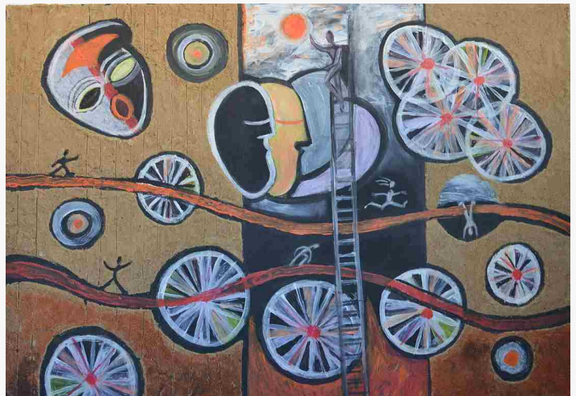
Yanay Prague; Quo Vadis, 120 cm x 90 cm, 47 inches x 35 inches, acrylic on wood