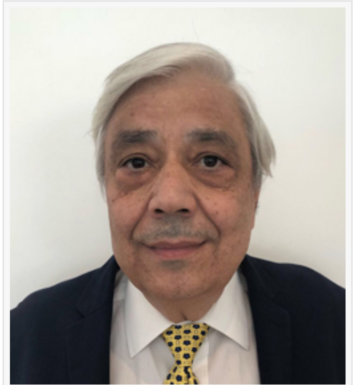
Senior Consulting Editor

This press release can be viewed online at: http://www.einpresswire.com