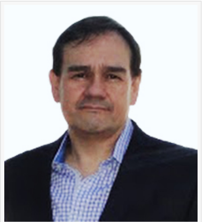
Editor in Chief