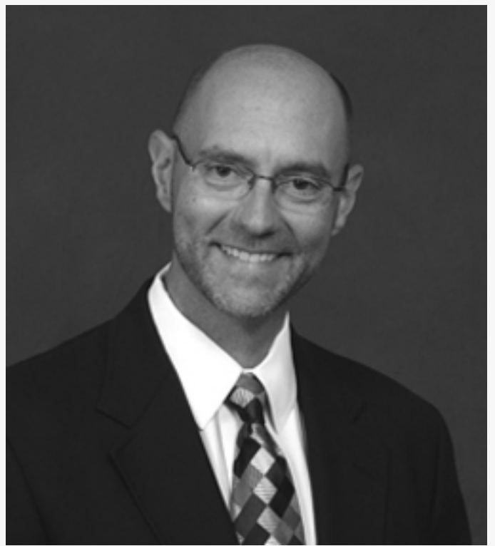
Senior Consulting Editor