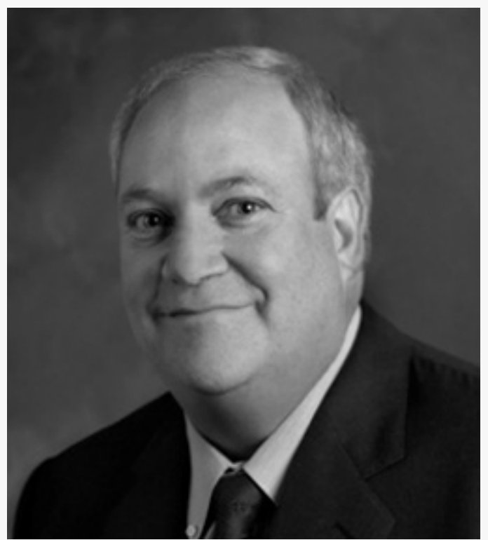
Editor in Chief