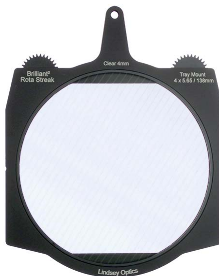
Lindsey Optics Brilliant 2 4mm Clear Rota-Streak Filter

This press release can be viewed online at: http://www.einpresswire.com