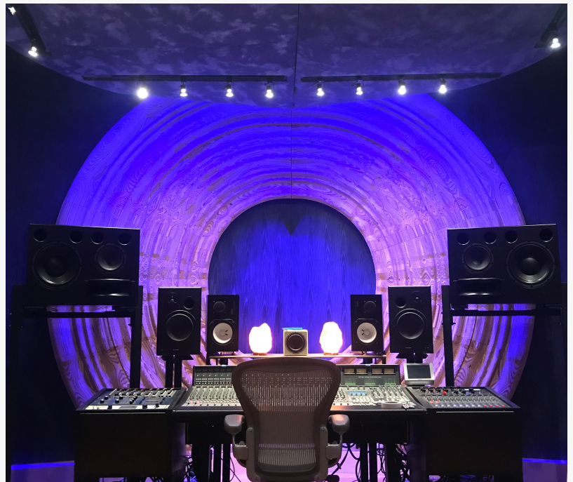
Electric Garden Recording Studio

Grey Noise Studios features two control rooms with the 8,200-watt Duo15-Sub218 system, in