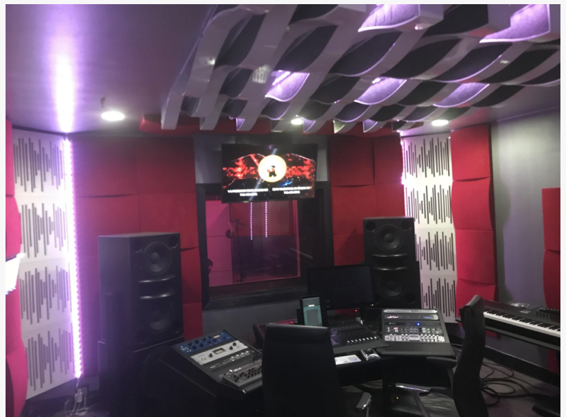
Polo Ground Studio A

Each Augspurger system is meticulously tuned to the company's decades-in-the-making reference mix curve, which ensures compatibility between other Augspurger-equipped studios around the world, such as NYC's Leila's Playground, Blast Off Studios, Atlantic Records, Quad Studios, Premier Studios, Penthouse Studios, House of Hits, Addicted to Mullah and Mix Pack Records. By matching the response curves from studio to studio, clients can work in any Augspurger room worldwide, and trust what they're hearing—even at high levels when feeling the music is equally crucial.