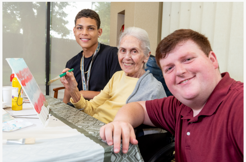
The Art for Life Event Featured in Long Island, New York

Culminating in art for life showcases throughout the network, each center hosted a community class and reception, offering all participants bragging rights to their beautiful pieces of imagination and creativity. The winning submissions from each CareRite Center nationwide are to be used for the company's national 2019 network calendar.