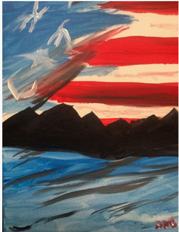
The Featured Winning Resident Painting Submitted in Boca Raton, Florida