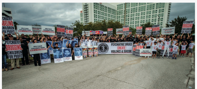
Hundreds of men, women and children made their voices heard at the 2018 Psych Congress in Orlando.

ORLANDO, FLORIDA, UNITED STATES, October 31, 2018 /EINPresswire.com/ -- The Citizens Commission on Human Rights (CCHR), a non-profit mental health watchdog dedicated to the protection of children, held a demonstration in Orlando at the Psych Congress protesting the drugging and electroshocking of children .