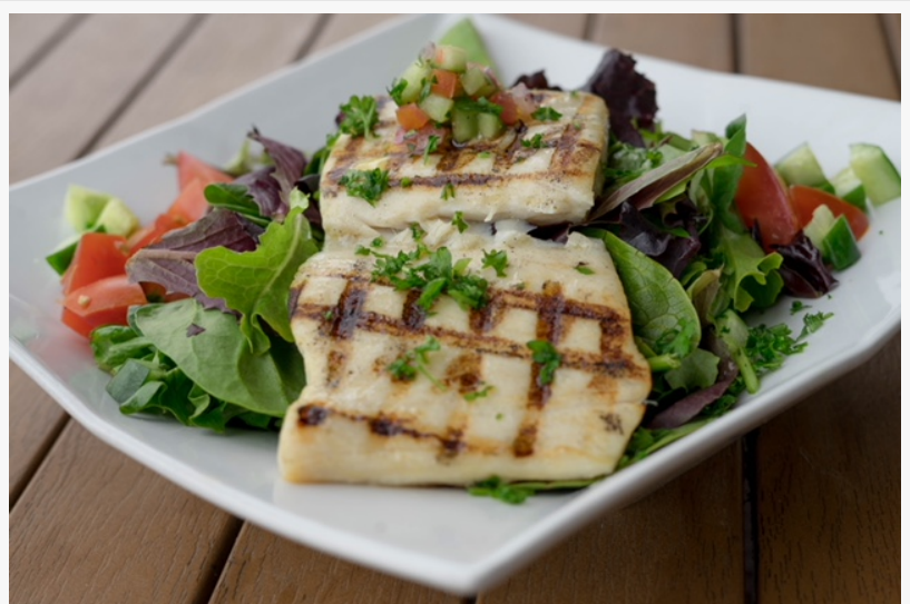
Grilled Fresh Fish over Greens

TUSTIN, CA, UNITED STATES, November 4, 2018 /EINPresswire.com/ -- Wouldn't it be nice to find food that is fast, fresh, healthy and inexpensive ? Everyone occasionally needs food in a hurry, but they prefer to avoid the typical "Fast Food" cuisine that is offered to us here in Orange County (like burgers & fries). Some fast food restaurants have added a couple of healthy choices, but their menus are quite limited. Fresh Off the Boat (FOB) Fish Grill is the solution to this issue. Imagine a place where you have tasty fresh fast inexpensive and healthy choices... that is the dynamic behind FOB. Finally, a place that solves this dilemma. Their menu has around 75 choices including grilled fresh Wild Salmon, Grilled Chicken, Ahi Tuna, Shrimp, and even Filet Mignon. You can order your protein over a beautiful bed of fresh greens, rice or in several other styles that will make your taste buds happy and fuel your body with essential vitamins and nutrients. They also have a nice selection of Vegetarian Dishes (each are marked on their menus).