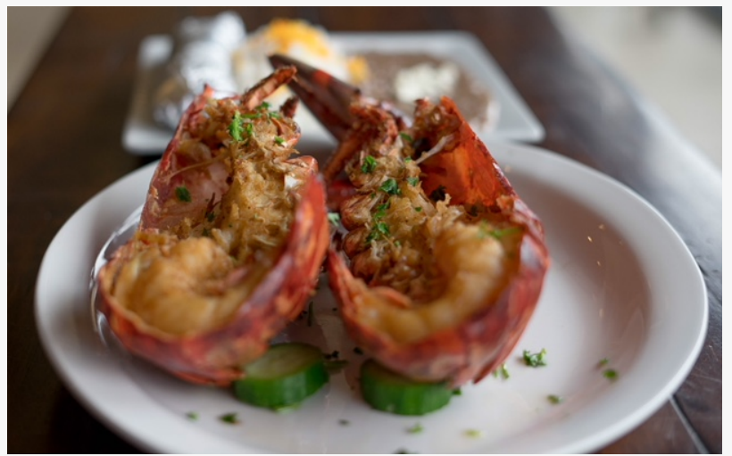
Choose Lobster or Shrimp