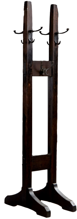
Stickley brothers Mission Oak design double costumer rack, 67.25 inches tall (est. $1,500-$2,500).

This press release can be viewed online at: http://www.einpresswire.com