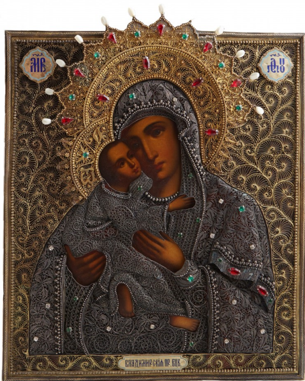
Russian icon of the Virgin of Vladimir (Moscow, 1893) (est. $5,000-$7,000).