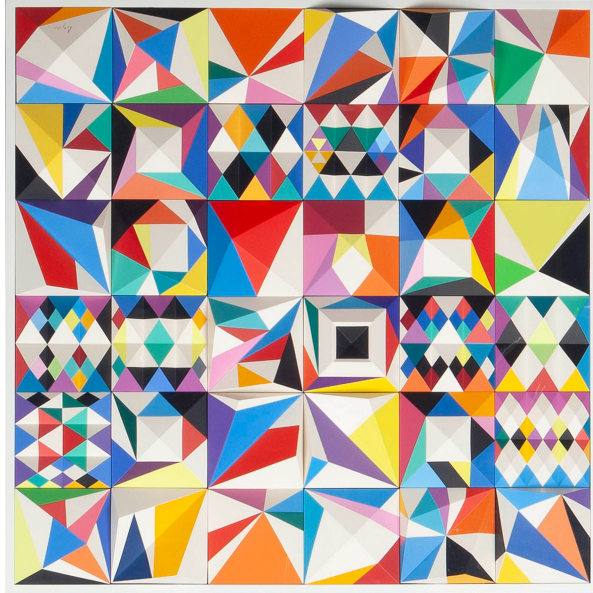
Color relief multiple from Israeli artist Yaacov Agam (b. 1928), titled Black Hole (est. $3,000-$5,000).

The category continues with a 19th century French provincial Louis XV-style carved cherry sideboard (est. $800-$1,200); a 19th century French inlaid burl elm cave a liqueur (lockable