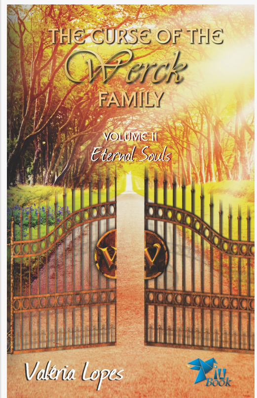
Book Cover "The Curse of the Werck Family, volume 2: Eternal Souls"