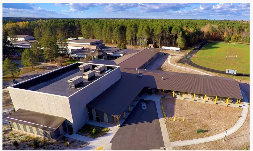
Over view new bug-o-nay-ge-shig high school