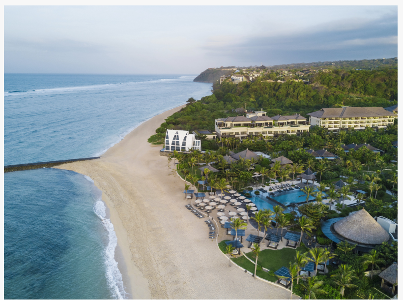
The resort's dramatic setting in the beautiful tourist enclave of Nusa Dua

Bali is a luxurious resort offering an elegant tropical ambience. Featuring tranquil views over the azure waters of the Indian Ocean the resort has 279 spacious suites and 34 expansive villas, providing the sheerest of contemporary Balinese luxury. Along the foreshore are The Ritz-Carlton Club®, six stylish dining venues, an indulgent and exotic marine-inspired Spa, and fun, recreational activities for children of all ages at Ritz Kids. A glamorous beachfront wedding chapel, makes an idyllic setting for destination weddings, while a range of outdoor event venues and extravagant spaces provide the perfect scene for celebratory events and wedding reception in Bali. Well-appointed conference venues, luxurious meeting spaces, customizable residential packages and experienced organizers also entice those looking to create inspired MICE Tourism events in Bali. Whether work, pleasure or romance is on the agenda, The Ritz-Carlton, Bali is the place to make memories that last a lifetime. Follow us