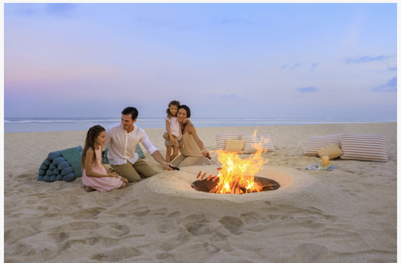
Family Bonfire by the beach

The Ritz-Carlton, Bali has been honored with a prestigious World Luxury Hotel Award