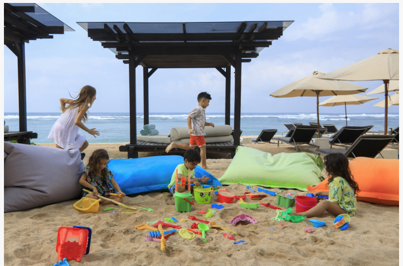
Ritz Kids provides an educative activities for kids