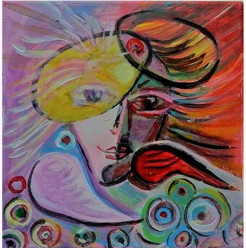
Yanay; Angels Have Two Faces, 20 cm x 20 cm, oil on canvas

protective means. To paint by acrylic is probably also in some way toxic, but not so dangerous. So now I prefer to paint with that, even it has other disadvantage as it dries very fast. When