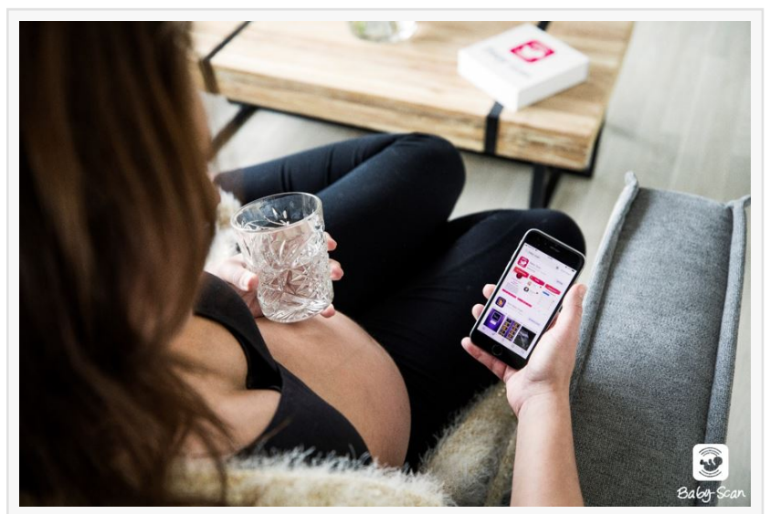
Baby Scan app available for IOS & Android

Experience pregnancy even more intensely with Baby-Scan! The world's first wireless 2D/3D echo scanner for mobile devices will soon be a fact! Empowering parents with 2D & 3D images of their developing infant, Baby-Scan and the corresponding app is slated to launch in January in Las Vegas during CES 2019, the world's gathering place for all those who thrive on the business of consumer technologies.