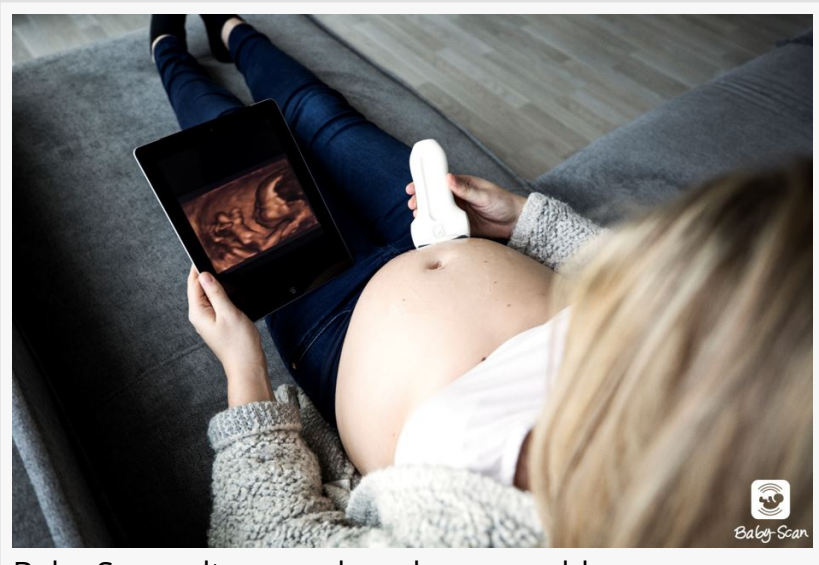
Baby-Scan, ultrasound made accessable

The Baby-Scan app enables you to save and share ultrasound imagery. You decide for yourself what you are going to do with those beautiful images and who are allowed to get a glimpse. All data is securely stored in the Baby-Cloud, so you do not have to worry about the security of your images. In your Baby-Scan account you can indicate with whom you want to share the echoes. So you can comfortably surprise family and friends with an update on the growth and development of your little one.