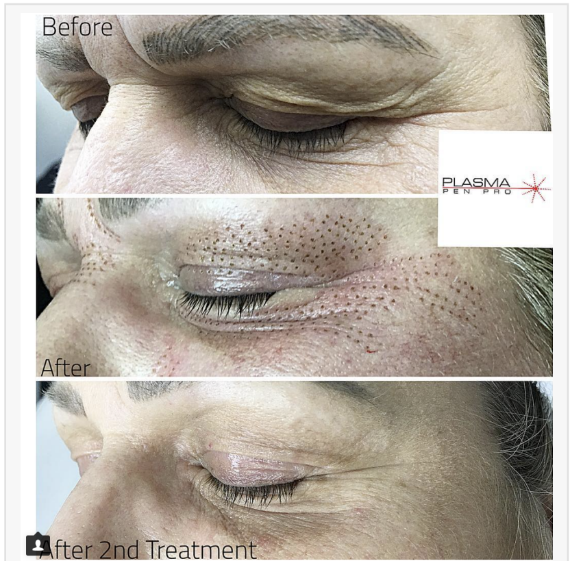
Eyebrow and Eyelid Lift by Plasma Pen Pro (PPP)

"Plasma Fibroblast training is the present and future of in the beauty industry, and it is only growing bigger by the day," remarked Rose Cruz from Plasma Pen Pro. "We have seen very real success stories from our partners and we know this is a trend that will just continue to grow. When you have a business model that works, an amazing product in plasma fibroblast training and certification, and a team that are experts in instruction, the sky is really the limit."