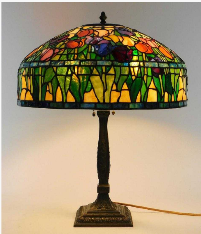
Fine, 20th century leaded glass rose bronze lamp attributed to Gorham, 22 inches tall (est. $2,000-$3,000).

Asian offerings will include a circa 1900 palace-size Persian Mahal wool carpet rug, 26 feet 2 inches by 17 feet 3 inches, having a diamond ivory medallion with floral tendrils surrounded by thousands of flowers and lattice work within geometric and floral borders (est. $3,000-$5,000); and a Chinese Qing Dynasty celadon white jade plaque, 4 inches by 3 ¼ inches, showing a fine, reticulated carving of a phalanx of storks foraging in a marsh in high relief (est. $2,000-$3,000).