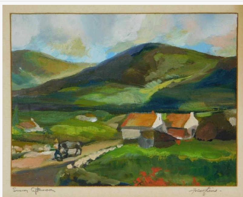
Post-Impressionist oil on board titled Sunny Afternoon by Franz Kline (Am., 1910-1962) (est. $5,000-$8,000).

The auction will begin promptly at 10 am Eastern time. Online bidding will be facilitated by bidLIVE.Bruneauandco.com , LiveAuctioneers.com , Invaluable.com and Bidsquare.com , or by downloading the mobile app "Bruneau & Co." on iTunes or GooglePlay. Previews will be held on Wednesday, Nov. 21, and Friday, Nov. 23, from 9-5. Doors will open auction day at 8 am.