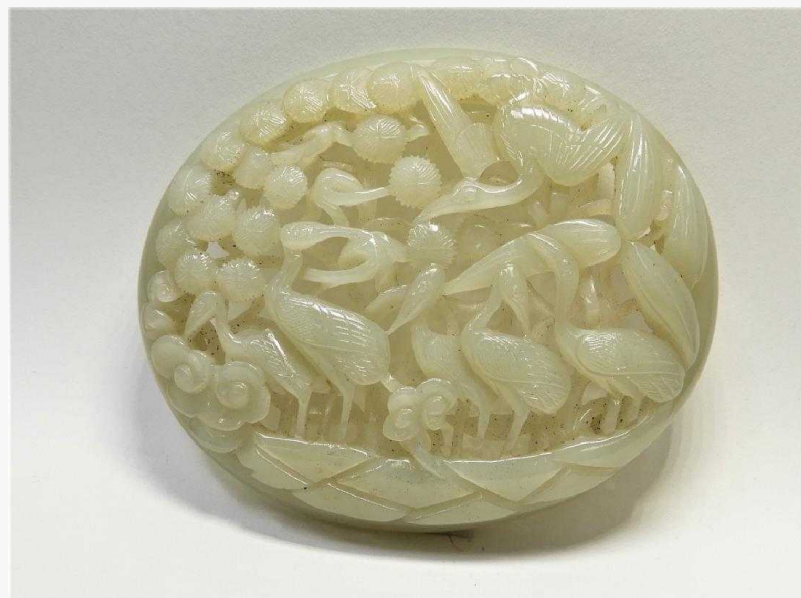
Chinese Qing Dynasty celadon white jade plaque with a fine, reticulated carving of storks (est. $2,000-$3,000).