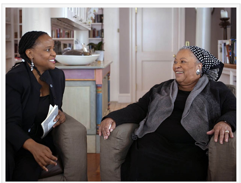
Toni Morrison in "Foreigner's Home"

Some titles come directly from important national and international film festivals such as Sundance, the Tribeca Film Festival, the Pan African Film Festival, FESPACO, Cannes, Slamdance and Berlinale. Some of the films celebrate the contribution of men