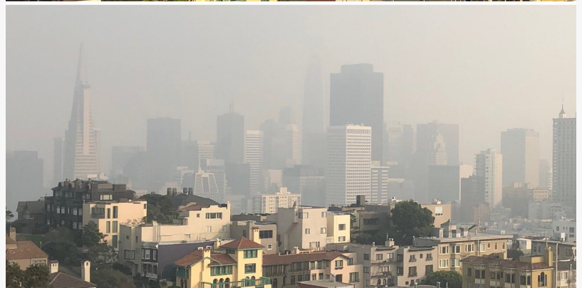
San Francisco - Before and After pollution