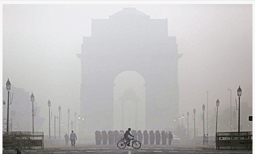
India Gate - Air pollution in Delhi - India

SIDCO Homes have no heating furnace in the house, we have switched over to the Heat Pump technology for heating and cooling, this is many times more efficient than the regular furnaces. The whole house is completely sealed with closed cell foam for insulation and air tightness. We perform the door blower test to check for leaks and the performance of the HVAC for the house. HERTZ test is conducted for the certification of the ducts, which are new and have a R8 rating for