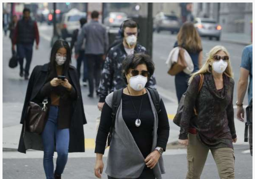
People wearing Air Mask in San Francisco

I had never seen such a site in Bay Area where the air quality index was Very Unhealthy air quality. Next day I saw the air quality index maps and learned that the air quality in Chico next to Paradise fire was over 500 and San Jose air quality is Very Unhealthy.