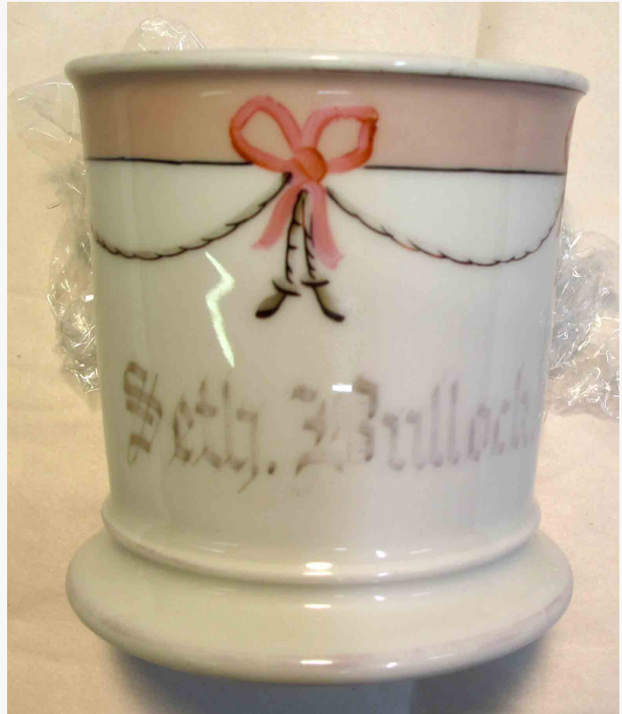
Unique shaving mug from one of the West's most famous sheriffs -- Seth Bullock of Deadwood, South Dakota.

The headliner of Day 3, in terms of high pre-sale estimate, is a completely restored 1929 DeSoto Model K Roadster "Espanol" with double side mounts and trunk (est. $25,000-$30,000). The car, shown at the National DeSoto Club convention in Reno in 2011, has been garaged and covered for the past 31 years and features Chrysler disc brakes, which later became an industry standard.