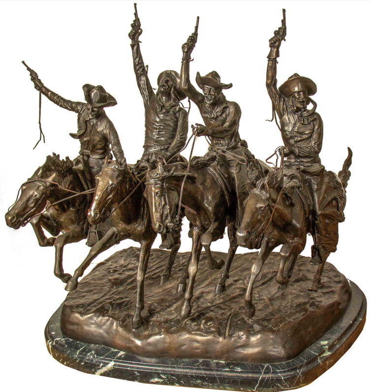
Frederic Remington bronze sculpture titled Coming Through the Rue, 20 inches tall, #22 of 100.