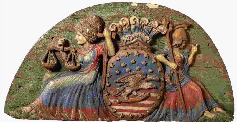
Early 20th century half-round early casting from a wood original of what may be an aftcastle for the clipper ship Lady Liberty.