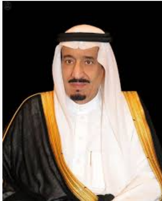
The Custodian of the Two Holy Mosques King Salman

This press release can be viewed online at: http://www.einpresswire.com