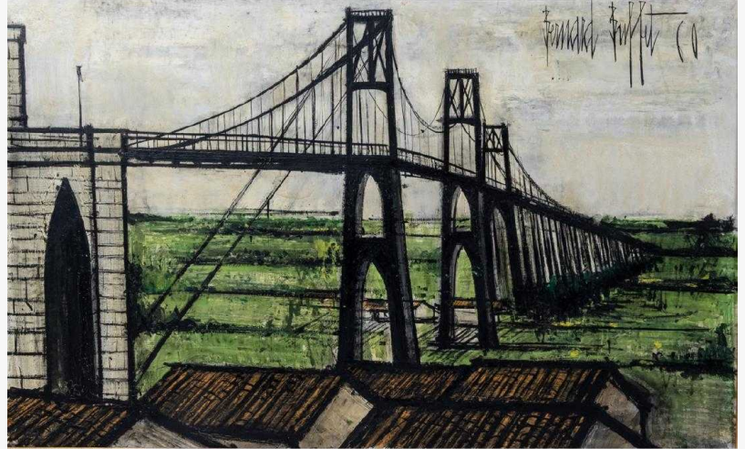
Le Pont Suspendu by the French Expressionist painter Bernard Buffet (1928-1999).