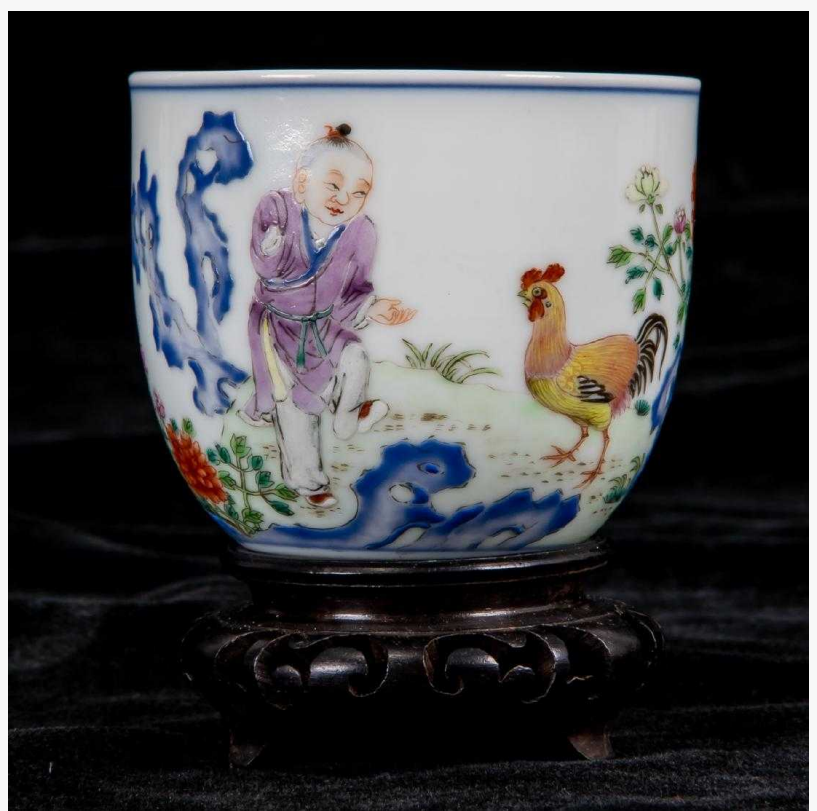
Rare 18th century Famille-Rose 'Boy and Chicken' cup with Imperial poem and mark of the Qianlong period.