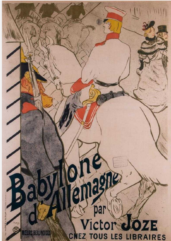
Colored lithograph by Henri de Toulouse-Lautrec (French, 1864-1901), to promote the release of a novel.