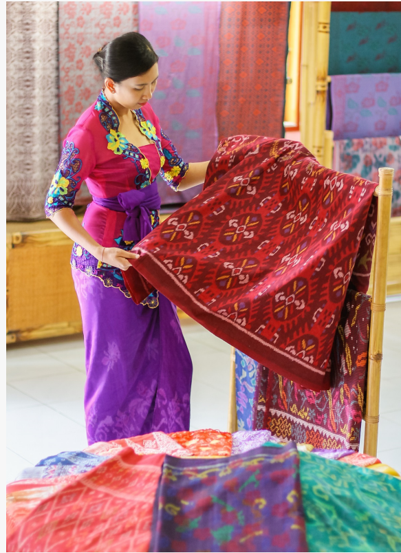
Sarongs are reflective of the historical traditions of Bali