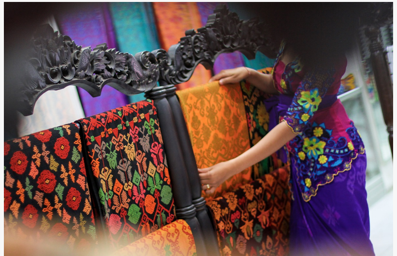
Sarongs are worn for many different types of occasions, including religious ceremonies