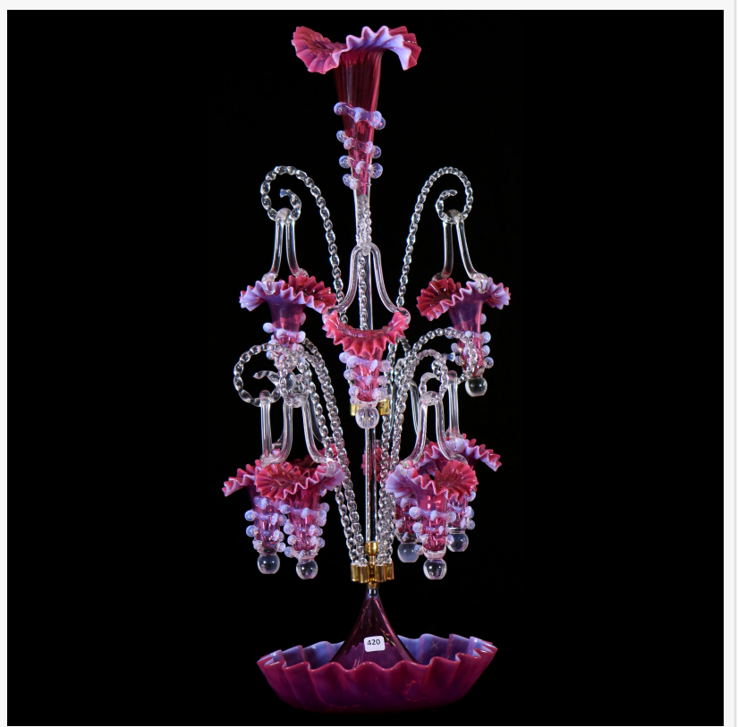
English cranberry opalescent art glass two-tier epergne with nine baskets and one lily ($5,500).

This press release can be viewed online at: http://www.einpresswire.com