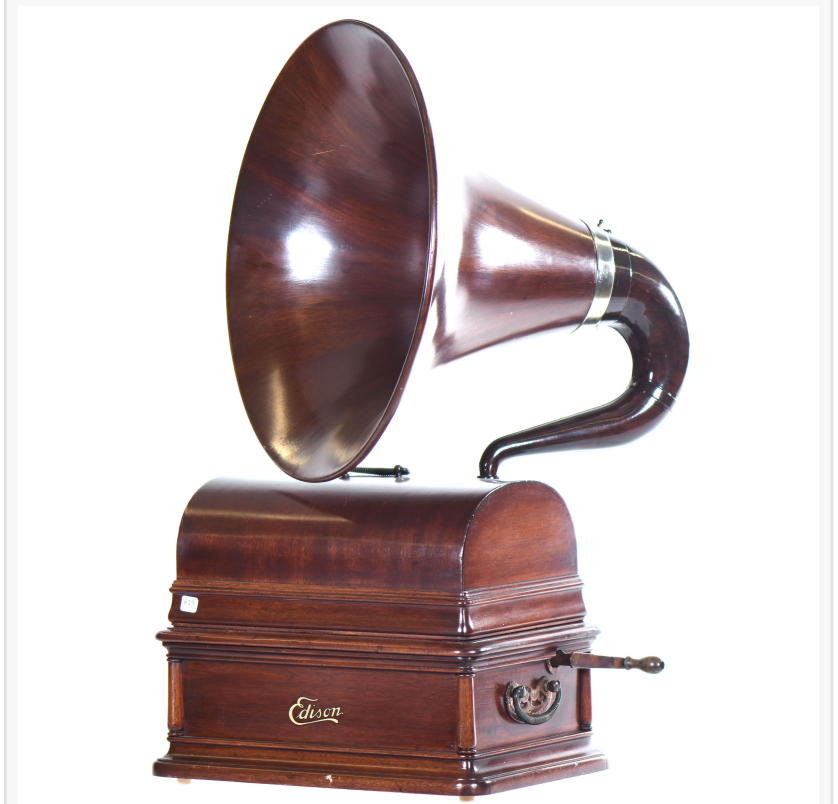
Edison Model A opera music box in a mahogany case, with mahogany cygnet horn ($4,250).