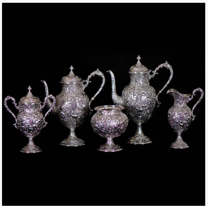
Sterling silver tea service, marked Loring Andrews Company of Cincinnati ($14,000).

Following are additional highlights from the auction. Over 680 lots came up for bid over the course of the two days. About 120 people were present each day. Just over 1,000 people participated online via LiveAuctioneers.com, posting 79,710 page views for the two days. On Invaluable.com, 445 people signed up, posting a two-day total of 87,347 page views. All prices quoted in this release are hammer.