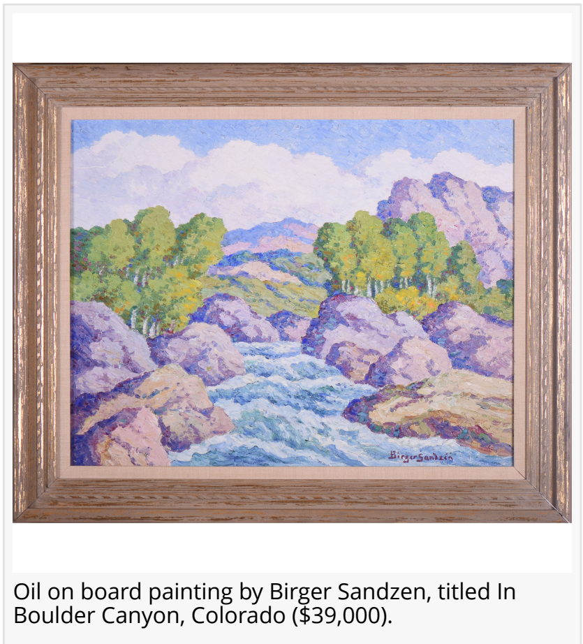
Oil on board painting by Birger Sandzen, titled In Boulder Canyon, Colorado ($39,000).