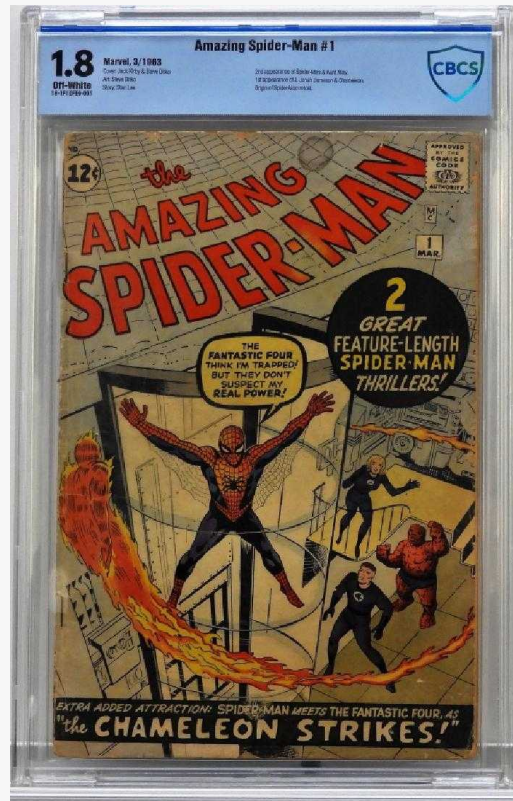
Copy of Marvel Comics Amazing Spider-Man #1 (Mar. 1963), graded CBCS 1.8 (est. $3,000-$5,000).