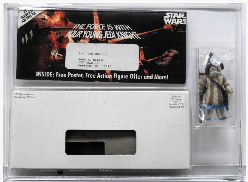
1984 Kenner Star Wars Young Jedi Knight kit mail-away internal sample, graded CAS 85 (est. $2,000-$3,000).