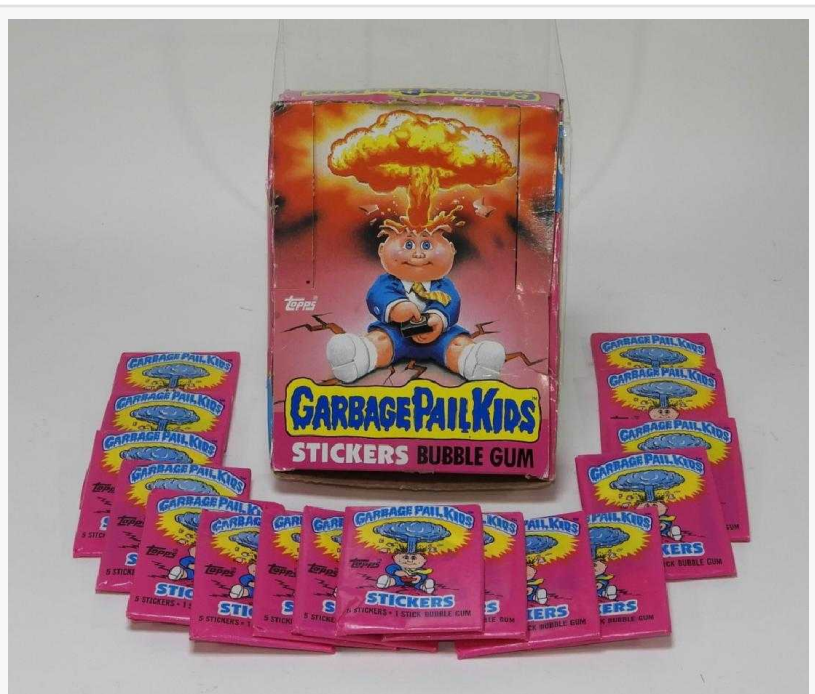
Set of 16 Garbage Pail Kids Series 1 trading card wax packs from 1985, unopened, with box (est. $1,500-$2,500).