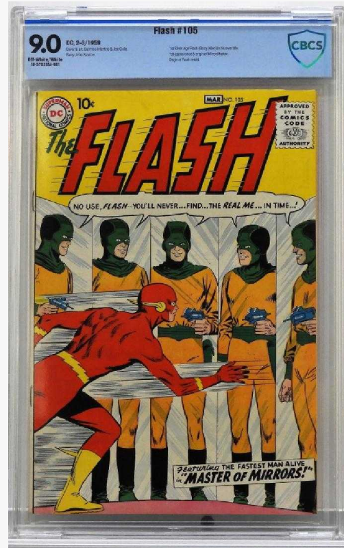
Copy of DC Comics Flash #105 (Feb-Mar. 1959), featuring the first Silver Age Flash in his own title (est. $15,000-$25,000).

Travis Landry Bruneau & Co. Auctioneers + 17708420212 email us here