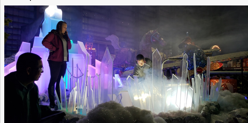
IECRM apprentices and electricians prepare for the 2018 parade with new LED technology added

community, creating new jobs, and training growing numbers of students each year.