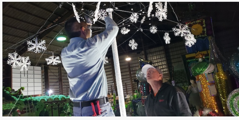
IECRM apprentices and electricians prepare for the 2018 parade with new features

IECRM is nationally recognized across the U.S., and in late September brought home 13 of the 17 Independent Electrical Contractors national convention top awards. In October, IECRM was honored by the City of Northglenn's Community Spirit award for its incredible corporate citizenship over the past two years, investing millions of dollars in the