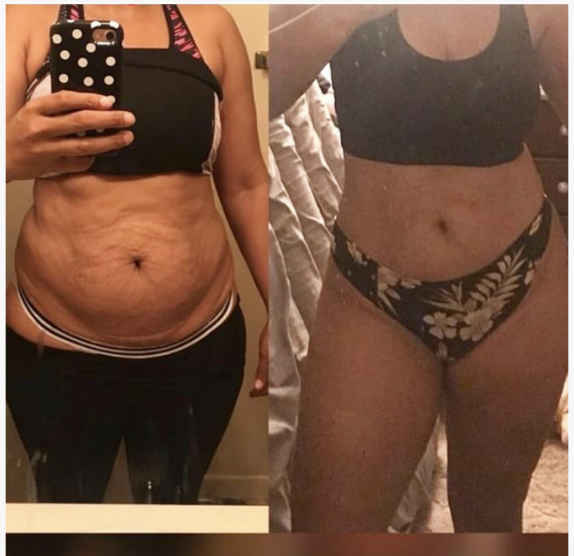
Gel V Before & After