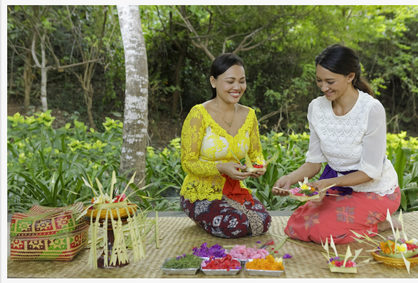
Learning the fragrant craft of making Canang Sari

About The Ritz-Carlton, Bali. Located on a stunning beachfront combining with a dramatic clifftop setting, The Ritz-Carlton, Bali is a luxurious resort offering an elegant tropical ambience. Featuring tranquil views over the azure waters of the Indian Ocean the resort has 279 spacious suites and 34 expansive best villas in Bali, providing the sheerest of contemporary Balinese luxury. Along the foreshore are The Ritz-Carlton Club®, six stylish dining venues, an indulgent and exotic marineinspired Spa, and fun, recreational activities for children of all ages at Ritz Kids. A glamorous beachfront wedding chapel, makes an idyllic setting for destination weddings, while a range of outdoor event venues and extravagant spaces provide the perfect scene for celebratory events and wedding reception in Bali. Well-