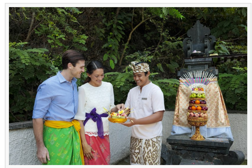
Experience the Balinese cultural activities for the Club Level guests

"Bali is famous for its rich cultural heritage and our discerning guests are always looking for exclusive experience while staying at the resort. As part of the benefits, Club guests can now join in the exclusive daily activities offered