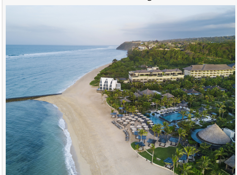
Immerse yourself in the fascinating culture at The Ritz-Carlton, Bali

This press release can be viewed online at: http://www.einpresswire.com