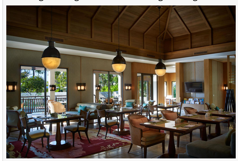
A cozy Club Lounge at The Ritz-Carlton, Bali

appointed conference venues, luxurious meeting spaces, customizable residential packages and experienced organizers also entice those looking to create inspired MICE Tourism events in Bali. Whether work, pleasure or romance is on the agenda, The Ritz-Carlton, Bali is the place to make memories that last a lifetime. Follow us on Facebook, Instagram, Twitter, Youtube, LinkedIn.