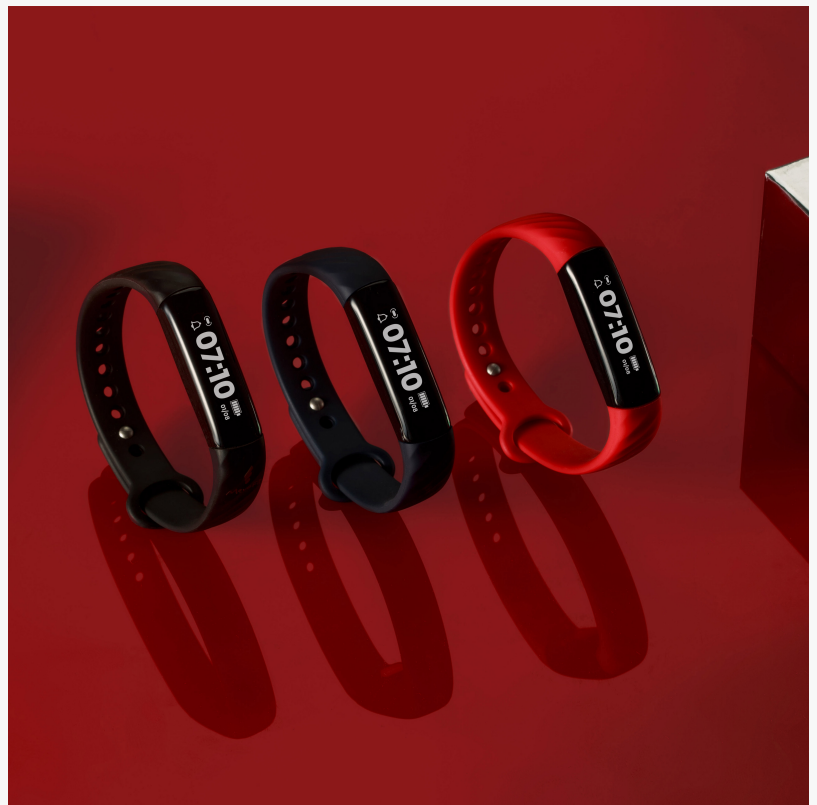
MevoFit Slim & Slim + HR (Black, Blue & Red)

These sleek and stylish trackers are smart in its creation and has inbuilt tracker for steps made, calories burned, distance covered, sleep details and multi sports tracker as well. MevoFit Slim + HR has an inbuilt optical heartbeat sensor which can further trace the user’s pulse with history records.