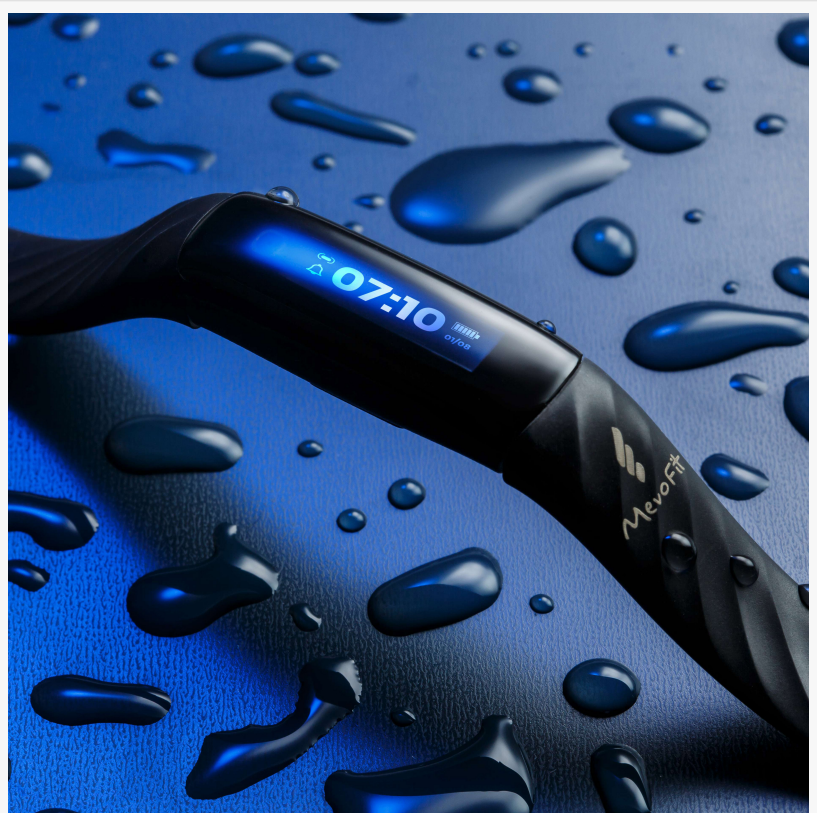
MevoFit Slim IP 67 Water Resistant Fitness Band