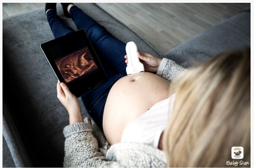
Baby-Scan, ultrasound made accessible

The Baby-Scan app enables you to save and share ultrasound imagery. You decide for yourself what you are going to do with those beautiful images and who are allowed to get a glimpse. All data is securely stored in the Baby-Cloud, so you do not have to worry about the security of your images. In your Baby-Scan account you can indicate with whom you want to share the echoes. So you can comfortably surprise family and friends with an update on the growth and development of your little one.