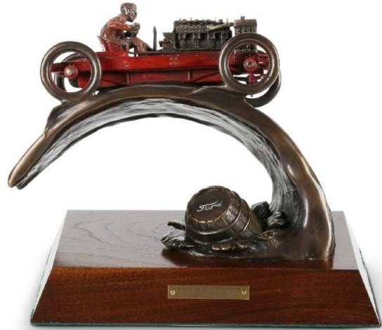
One of four car-themed sculptures by former GM designer and sculptor Alexander Buchan (est. CA$2,000-$4,000).

Three impressive oak library bookcases built circa 1910 carry estimates ranging from CA$3,000-$6,000. All three boast beveled glass, fluted corner and half-columns and arched door tops and are crafted from quarter-sawn oak. The finishes are mostly original, with professional moulding restoration and replacement. All three bookcases are 78 inches tall and come in varying widths.