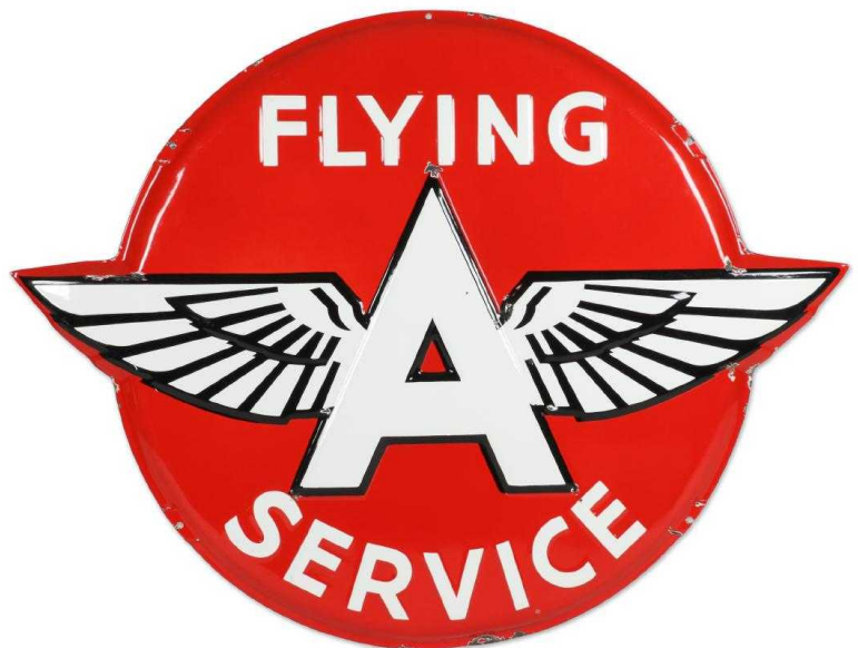
Flying "A" Service raised porcelain gas station sign, 48 inches by 58 inches (est. CA$4,000-$6,000).