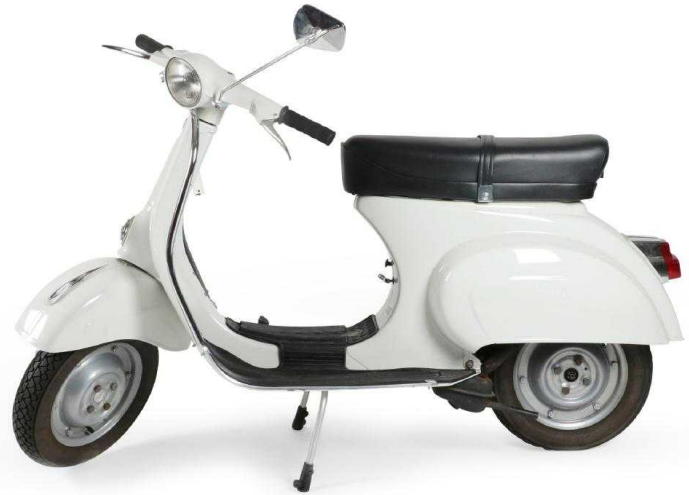
1964 Piaggio Vespa "90" scooter with just 10,126 original miles on the odometer (est. CA$2,000-$3,000).

A Howard & Company (N.Y.) bronze “bell” clock, made circa 1900, with marked porcelain dial and movement stamped “EP Depose 5879”, all original with perfect patina (and with a replaced pendulum) should rise to CA$2,000-$3,000; and a Liberator Cycles & Automobiles French poster, also circa 1900, by Jean De Paleologue