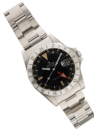
Rolex Steve McQueen Explorer II stainless steel, automatic dual time zone bracelet wristwatch ($17,500).