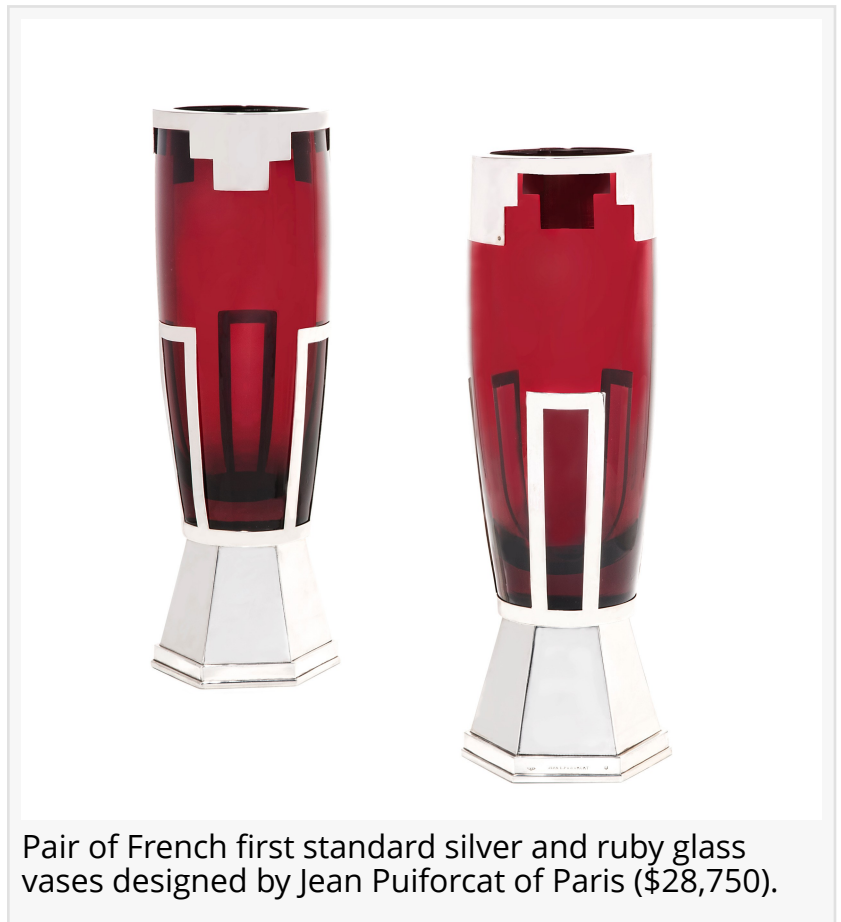
Pair of French first standard silver and ruby glass vases designed by Jean Puiforcat of Paris ($28,750).