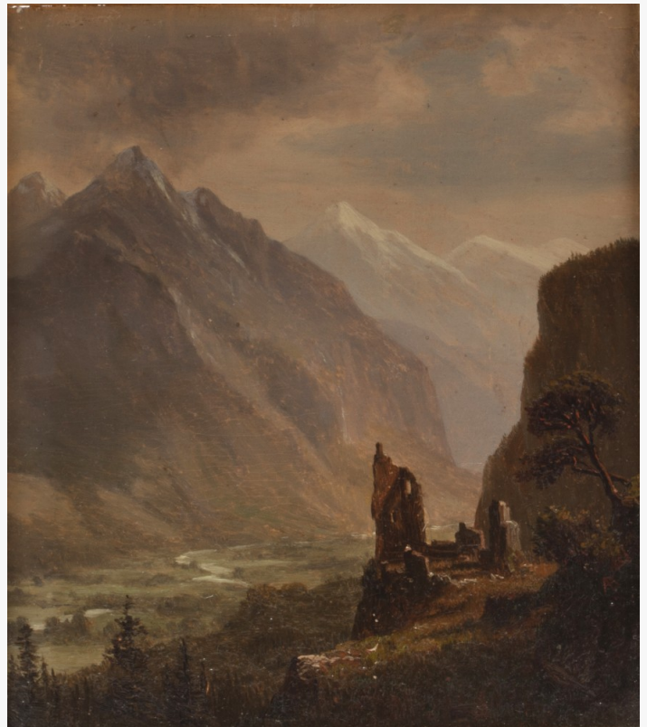
Oil on panel landscape painting by Albert Bierstadt (German-American, 1830-1901) ($8,750).