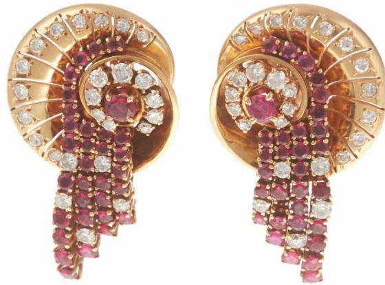
Pair of retro diamond, ruby and 18kt gold ear clips by Van Cleef & Arpels ($13,750).