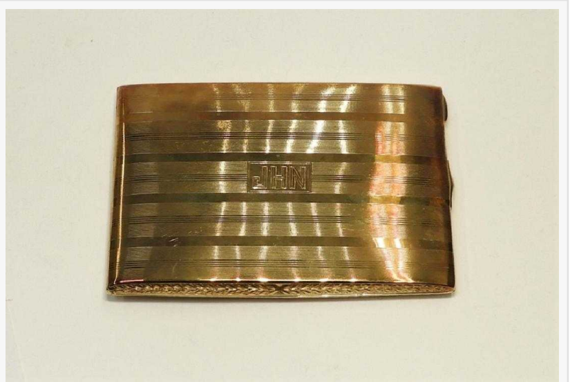
Circa 1920 Art Deco 14kt yellow gold cigarette case, monogrammed "JHN" ($6,875).

This press release can be viewed online at: http://www.einpresswire.com