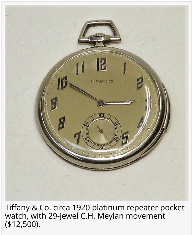
Tiffany & Co. circa 1920 platinum repeater pocket watch, with 29-jewel C.H. Meylan movement ($12,500).