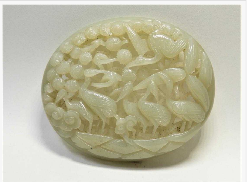
Chinese Qing Dynasty celadon white jade plaque with a fine, reticulated carving of storks ($2,812).

Travis Landry Bruneau & Co. Auctioneers +1 401-533-9980 email us here