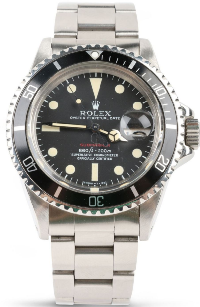
Circa 1972 Rolex red Submariner watch, ref. 1680, with stainless steel case and bracelet (CA$22,420).

A pair of Bvlgari South Sea cultured pearl and diamond drop earrings, claw-set in a curve and drop design with 28 round brilliant cut diamonds weighing 1.99 carats (with VS1 clarity and H-I color), plus two pear-shaped cut diamonds weighing 0.37 carats (VS1 clarity, H