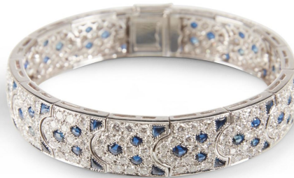
Cartier 18kt, diamond and sapphire Arcadie bracelet, pave set with diamonds and sapphires (CA$26,550).