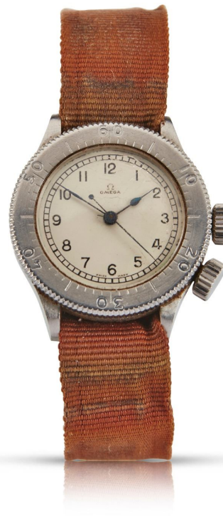
Genuine World War II-era Omega Weems Royal Air Force pilot's watch, circa 1940-41 (CA$8,260).