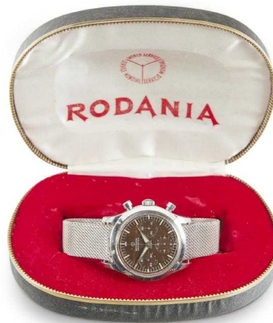
Circa 1960s Rodania Geometer gentleman's wristwatch in remarkable condition (CA$25,960).

The auction featured 21 estate fresh Rolex watches. "With three-year waiting lists on popular new Rolex models, buyers are quickly discovering value in the booming vintage market," Miller pointed out. The top achiever was a Rolex men's red Submariner wristwatch, ref. 1680, circa 1972, with