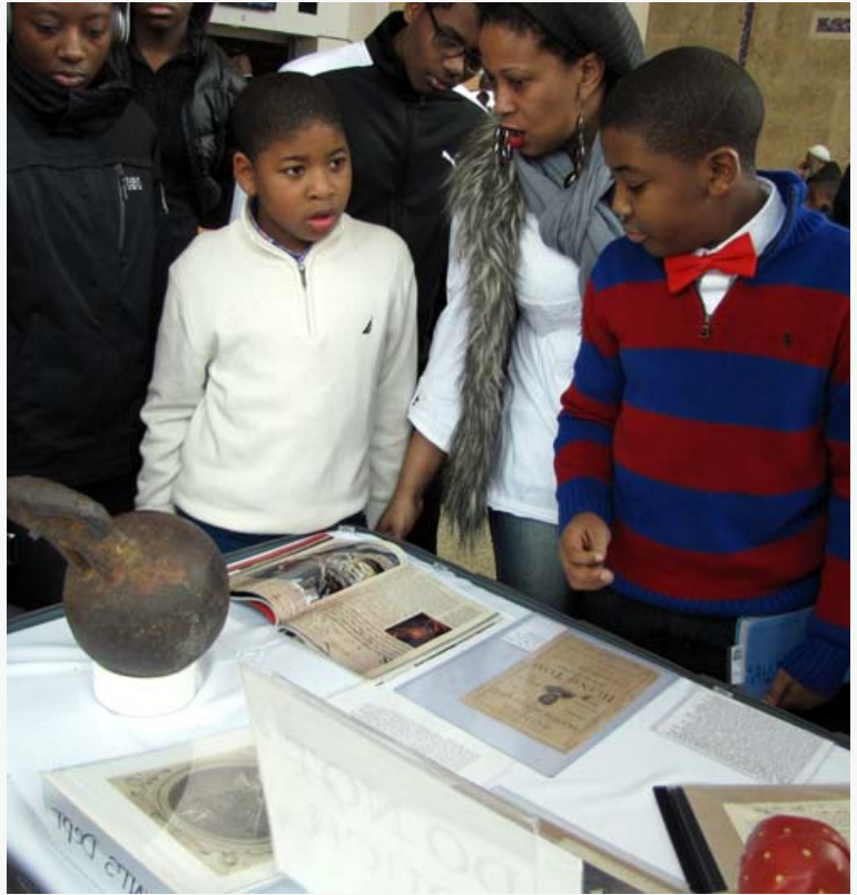
Mom Explaining Black History Documents and Artifacts to Her Kids