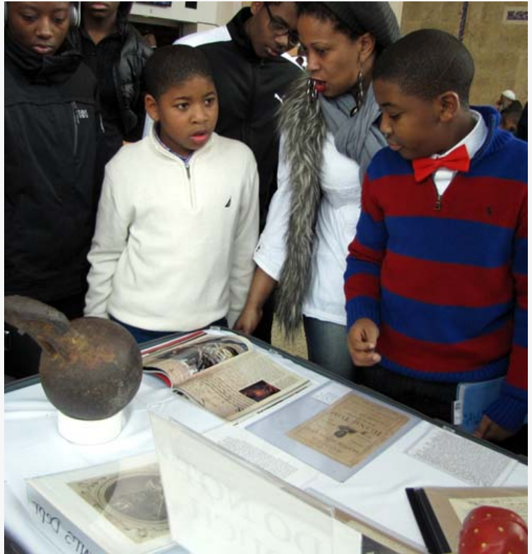
Mom Explaining Black History Documents and Artifacts to Her Kids