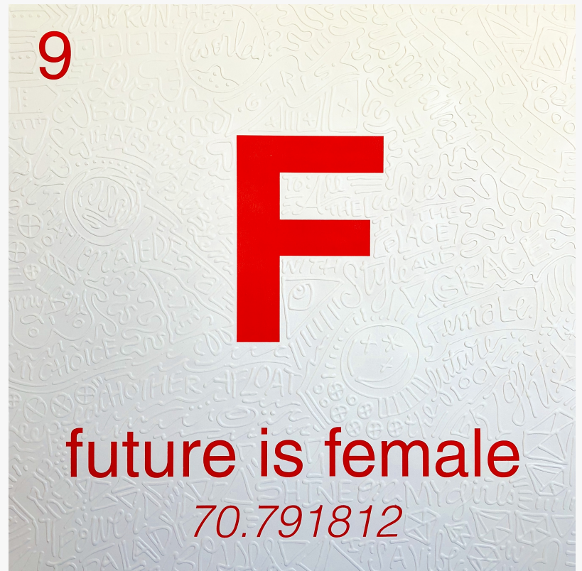
Cayla Birk. "Periodic Table of Relevance Series: FEMALE FUTURE" 2018, Acrylic, 3D Silicone Paint and Spray Paint on Canvas, 36 x 36 inches