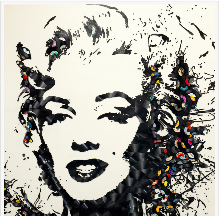
Mr. Brainwash "Marilyn Monroe" 2018, Broken Vinyl Records on Canvas, 84 x 84 inches