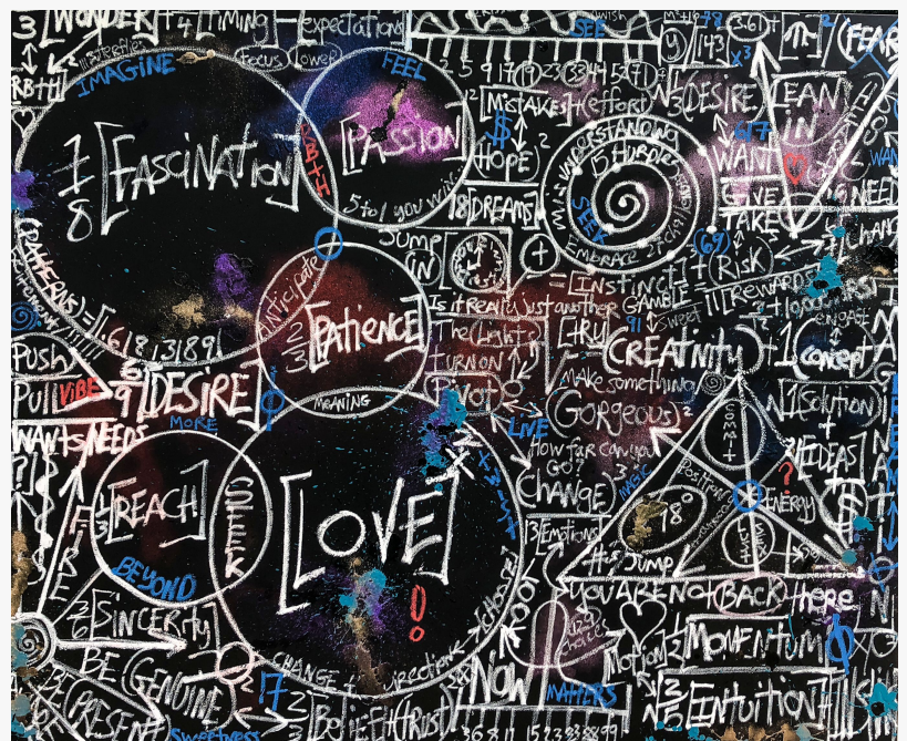
Brendan Murphy "No Expectations" 2018, Oil Acrylic and Gouache on Canvas, 60 x 72 inches