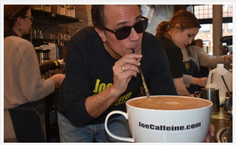
New World Record holder for buying the Most Expensive Cup of Coffee

De Pere/Green Bay, WI – Add 117 shots of espresso, 312 ounces of milk, four baristas, and an hour of time... and you set a new world record.