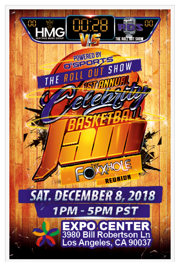
The Celebrity Basketball Jam features star-studded players on December 8 at the Expo Center in Los Angeles.

This press release can be viewed online at: http://www.einpresswire.com