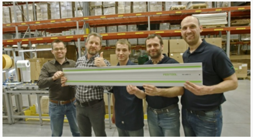
FESTOOL manufacturing in Lebanon Indiana