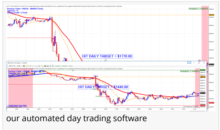
our automated day trading software

Exchange Mini-DAX. Viscuglia's software runs 23 hours a day and notifies the user with a ping when there is a trade. They then have two to five minutes to make the trade if they desire. The proprietary software is based on the Stock Trendline and EMA Stock line but has been reversed-engineered and set at a different timeline. His group does price action trading and earns when the market goes up or down. The group has been very successful finishing each week and month in the positive.