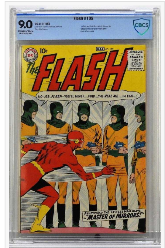
Copy of DC Comics Flash #105 (Feb-Mar. 1959), featuring the first Silver Age Flash in his own title ($20,000).