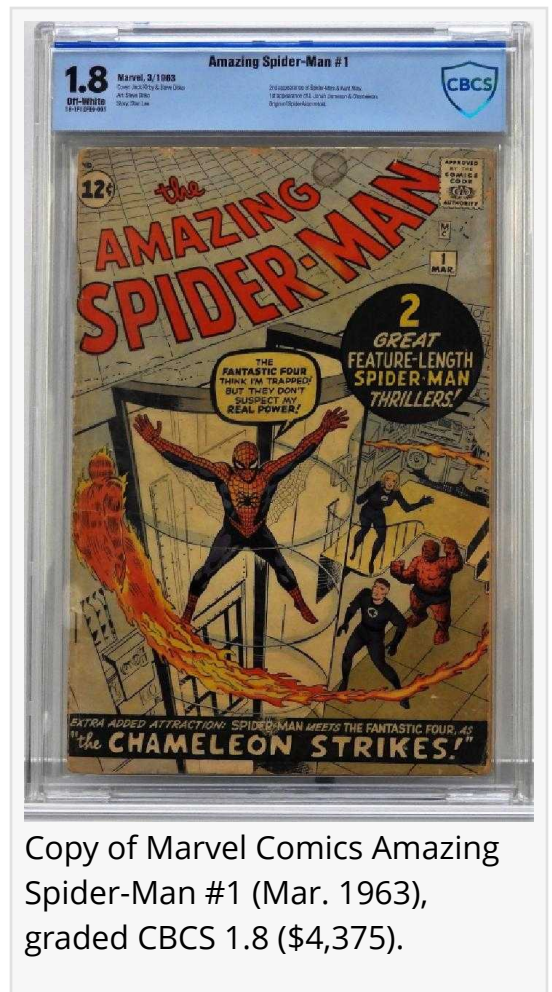
Copy of Marvel Comics Amazing Spider-Man #1 (Mar. 1963), graded CBCS 1.8 ($4,375).