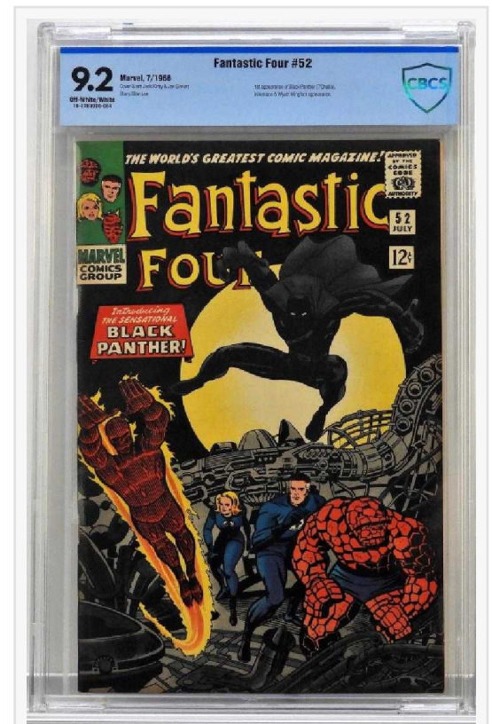
Copy of Marvel Comics Fantastic Four #52 (July 1966), graded CBCS 9.2, the first appearance of Black Panther ($7,500).

Travis Landry Bruneau & Co. Auctioneers +17708420212 email us here